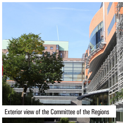
Exterior view of the Committee of the Regions

7:00-10:00 p.m. Official Dinner with addresses of the participating towns and theatre presentation by "Stolperdraht" Schwedt/Oder in the Thon Hotel EU