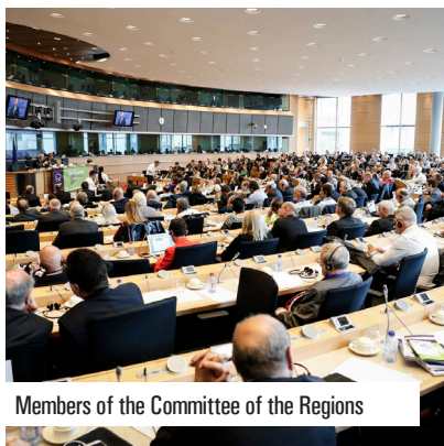
Members of the Committee of the Regions